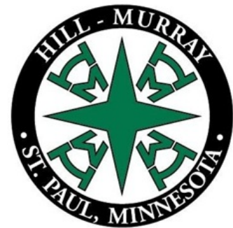
PROGRAM Future Leaders Hill-Murray School